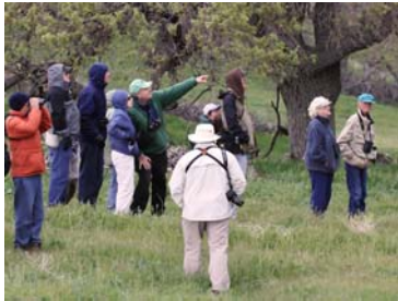
Birding @ Tejon