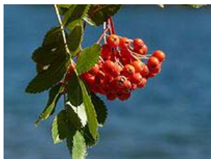
Tonyon Berries / Wiki