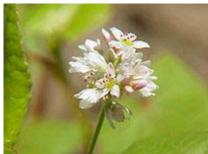
Buckwheat