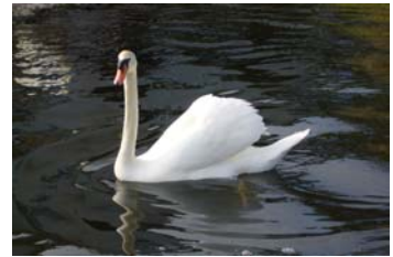
Mute Swan

A Mute Swan, looking for a handout, approaches one of the three boats used on the February 11 th Beginner's Bird Walk for exploring the far reaches and inlets of Westlake in search of both wintering species and evolving lakefront villas.