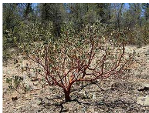
Manzanita Bush / Wiki