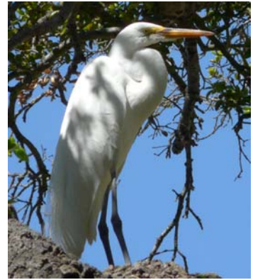
I observed this Great Egret in the park by the Thousand Oaks Library on two occasions over a three week period in April of 2008. I hope for a revisit.

Regular meetings are held on the first Monday evening of each month at the Western Foundation of Vertebrate Zoology, 439 Calle San Pablo, Camarillo at 7:30 pm, unless otherwise noted. Everyone is welcome. Take Pleasant Valley Road or Lewis Road to where they cross south of the 101 Freeway. Go west to the second street, Calle San Pablo. Turn right. The Foundation is the fifth building on the left.