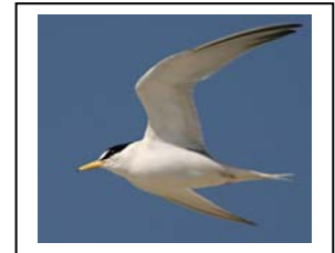
California Least Tern