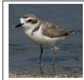
Western Snowy Plover

Photographs by Chrystal Klabunde of two of the birds featured in Richard Handley's address are provided below.