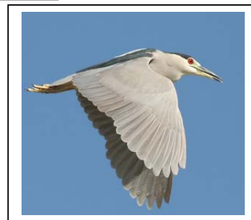
Black-crowned Night Herron In Flight