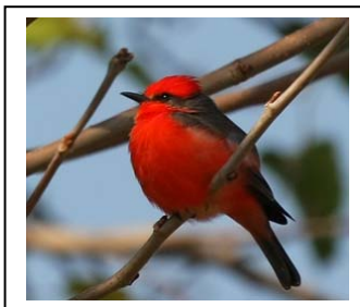
Vermilion Flycatcher

At Santa Paula : Vermilion Flycatcher, Black Phoebe, Say's Phoebe, Bluebirds, Yellow-Rumped Warbler.