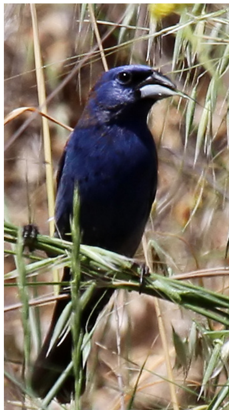
Blue Grosbeak by Don Klabunde