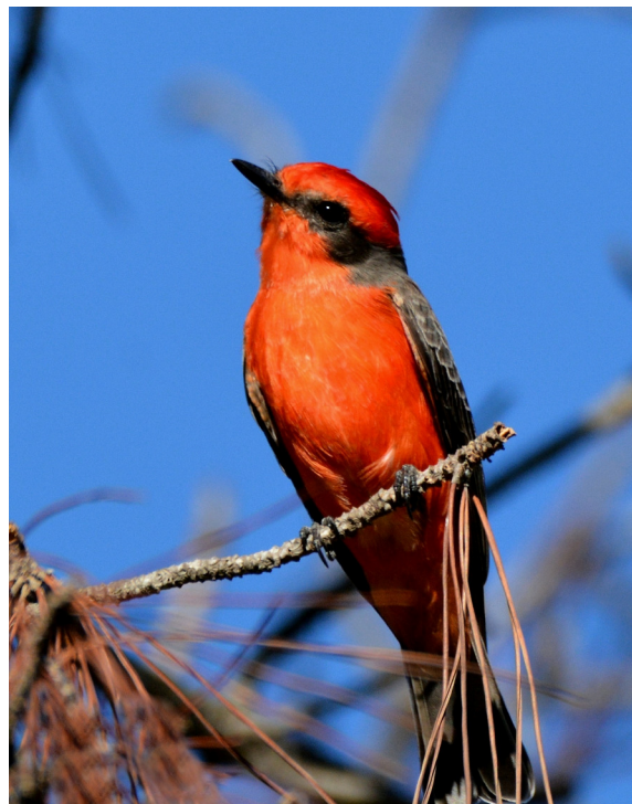
Vermillion Flycatcher