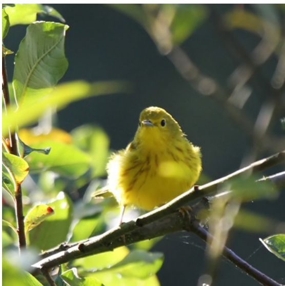
Yellow Warbler by Don Klabunde

There will also be a class walk on September 25 th , where we hope you will get to put your new warblers ID tricks to good use! Class size will be limited to 30 people and will be on a first come, first serve basis. Visit our website to sign up online. You can also sign up at our first meeting in September if there are any spots still available.