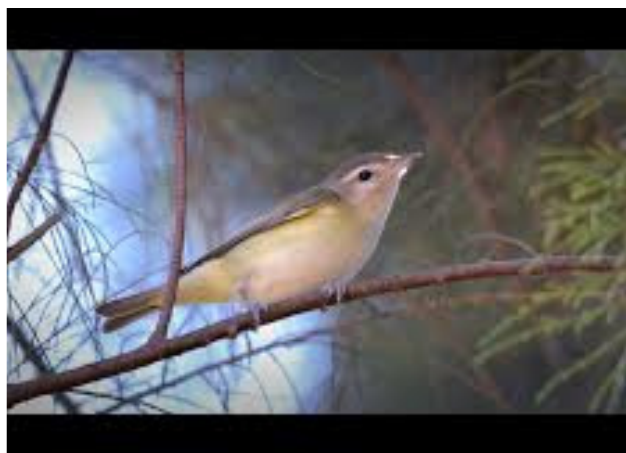
Warbling Vireo