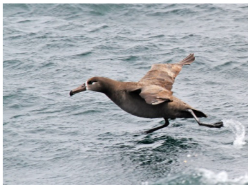
Black-footed Albatross